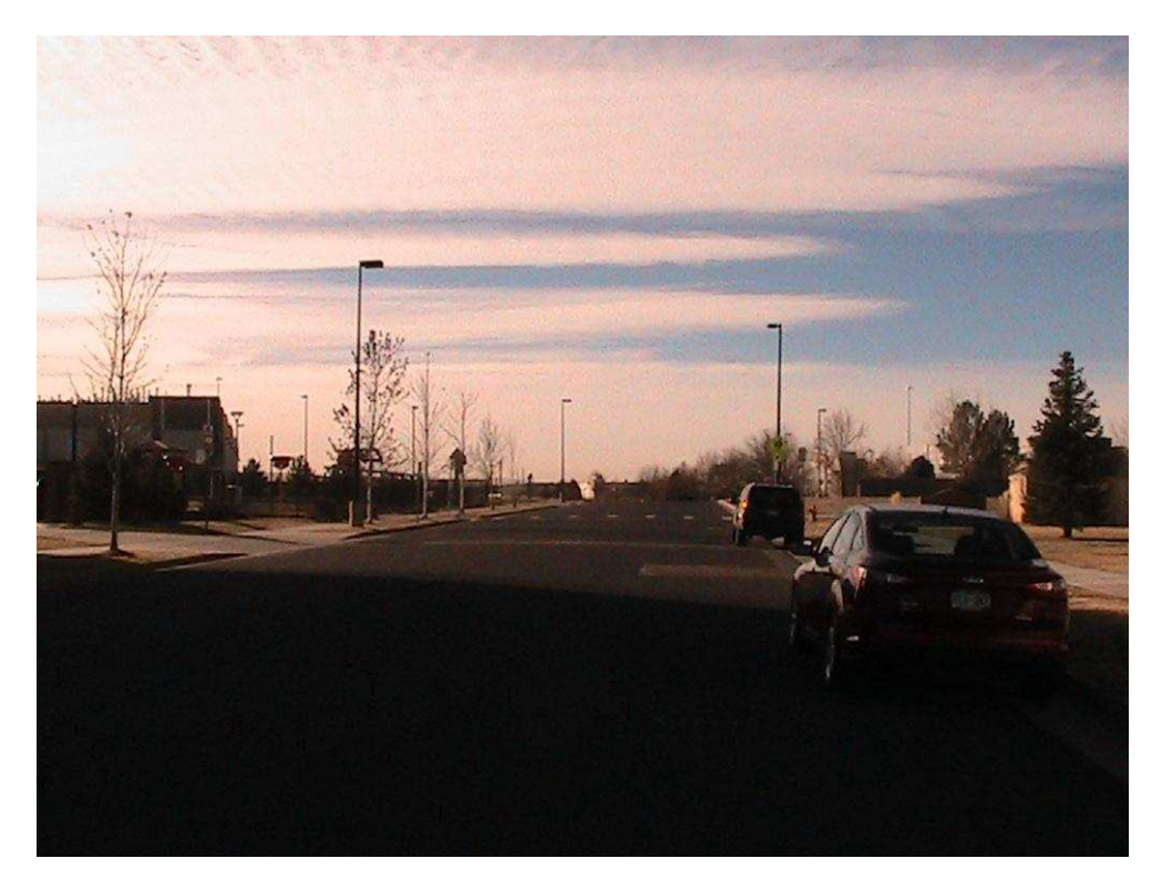
Property and Market Area Location