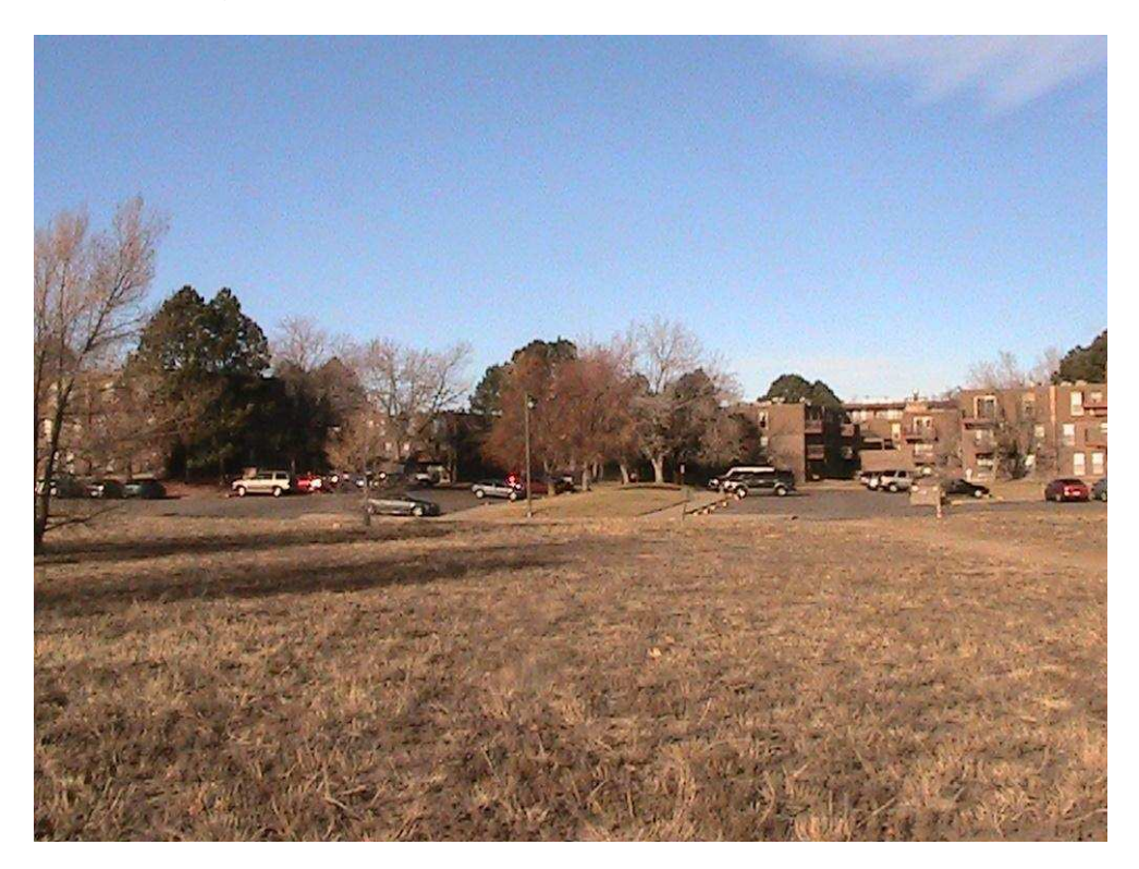
Looking North on Carson Street Towards Village Place Park: