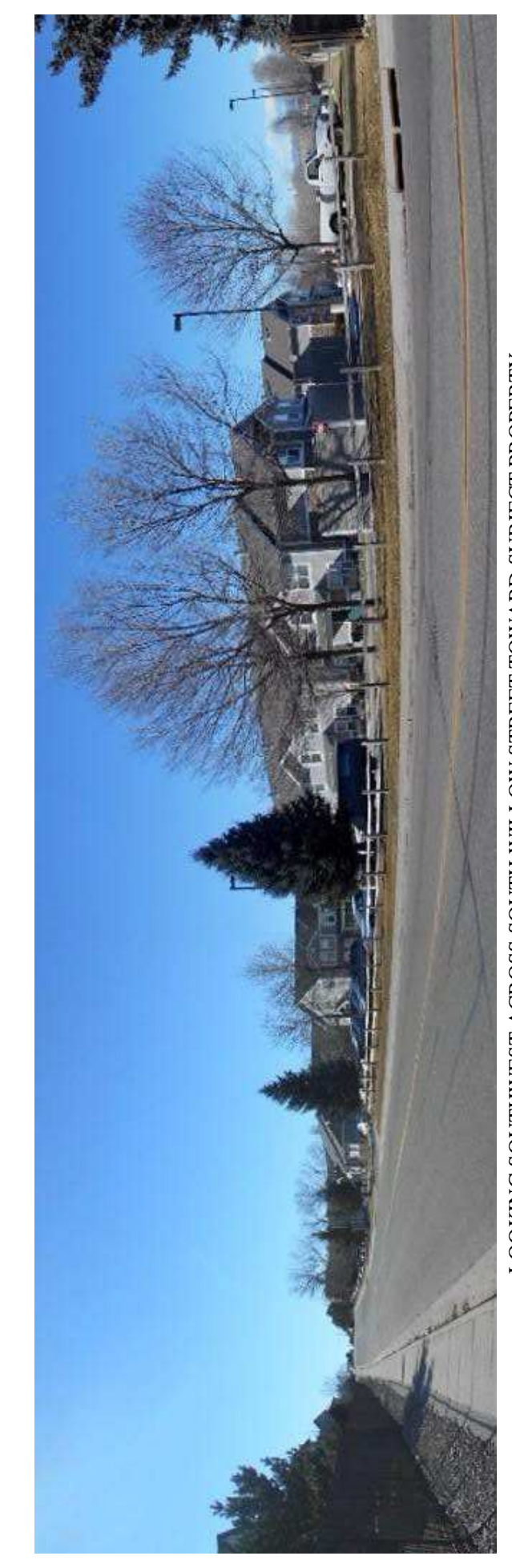
LOOKING SOUTHWEST ACROSS SOUTH WILLOW STREET TOWARD SUBJECT PROPERTY.