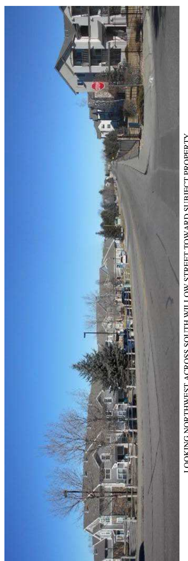
LOOKING NORTHWEST ACROSS SOUTH WILLOW STREET TOWARD SUBJECT PROPERTY.