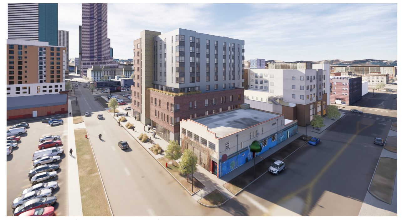
Rendering of Renaissance Legacy Lofts LIHTC and PAB with Stout Street Recuperative Care Facility