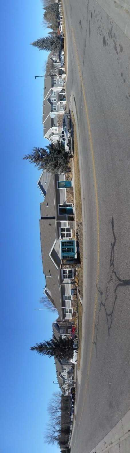
LOOKING WEST ACROSS SOUTH WILLOW STREET TOWARD SUBJECT PROPERTY.