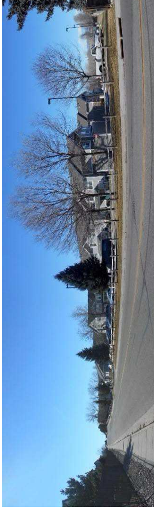
LOOKING SOUTHWEST ACROSS SOUTH WILLOW STREET TOWARD SUBJECT PROPERTY.