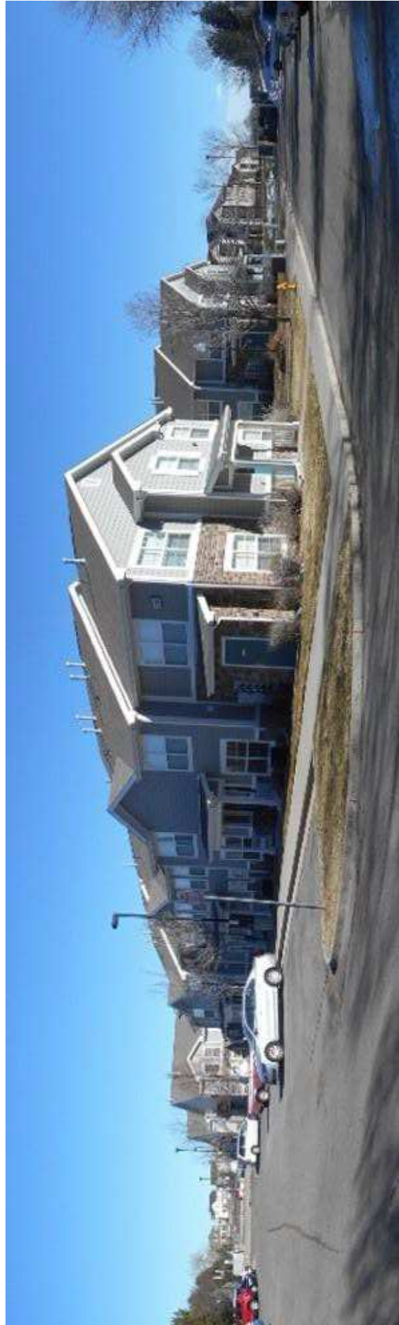
LOOKING NORTHEAST FROM SOUTHWEST CORNER OF SUBJECT PROPERTY.