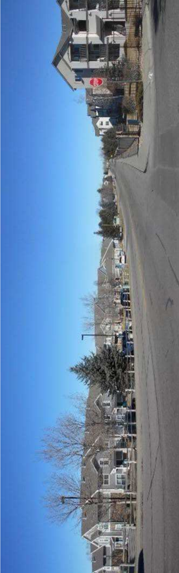
LOOKING NORTHWEST ACROSS SOUTH WILLOW STREET TOWARD SUBJECT PROPERTY.